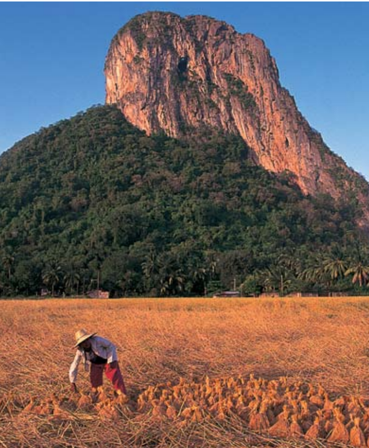
Khao Ok Thalu