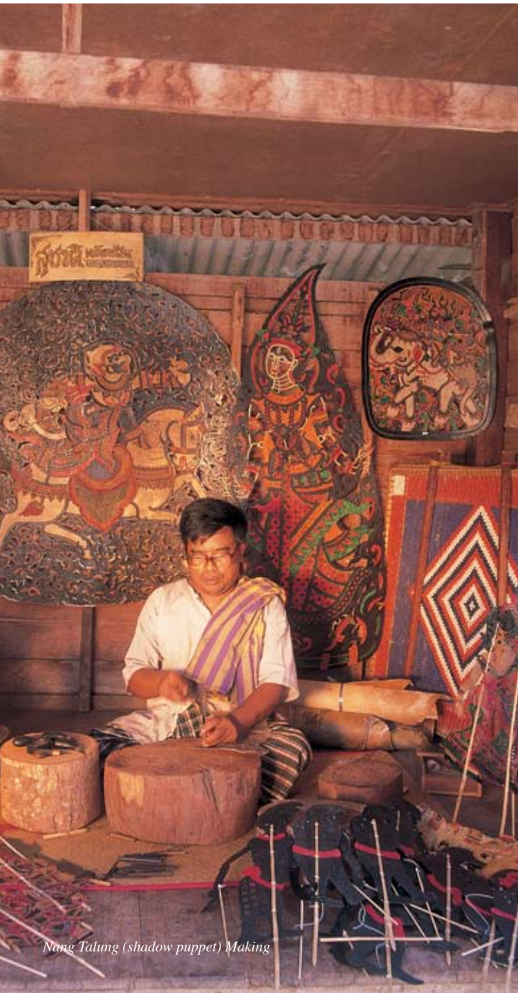
Nang Talung (shadow puppet) Making