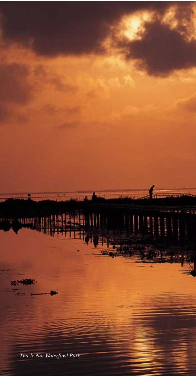
Tha-le Noi Waterfowl Park

some architectural buildings and more than 100 Buddha images lined around the chapel. It is located 6 km. from town along Route No. 4047.