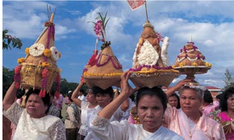
Festival of the 10 th Lunar Month

A full list of hotels can be obtained from the TAT office in Nakhon Si Thammarat at Sanam Na Mueang, Ratchadamnoen Road. Tel. 0 7534 6515-6 or www.tourismthailand.org .