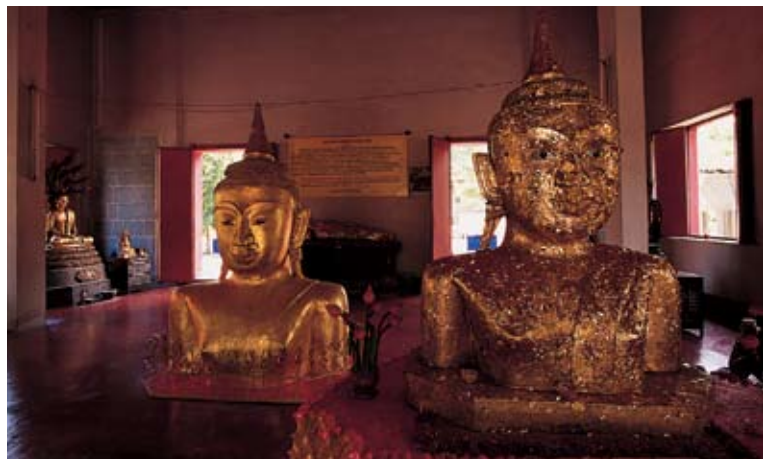
Wat Phra Thong

Inspired by Thailand's rich and exotic heritage, Phuket Fantasea not only showcases the charm and beauty of Thailand, but also enriches ancient Thai traditions with the wonder of cutting edge technology and special effects. The result is a stunning 140-acre theme complex packed with a multitude of activities and entertainment: a festival village with carnivals, games, handicrafts and shopping; a 4,000-seat restaurant offering a grand buffet of Thai and international cuisine; a breath-taking Las Vegas-style theatrical show, where state-of-the-art technology and special effects enhance the beauty of Thailand's myths, mysteries and magic in a wondrous extravaganza certain to delight everyone.