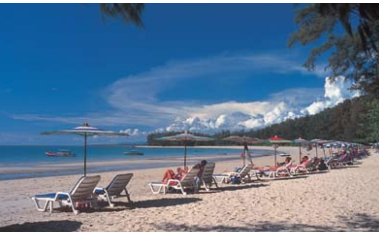
Hat Nai Yang

ber to February. Average temperatures range between 22 and 34 degrees Celsius.