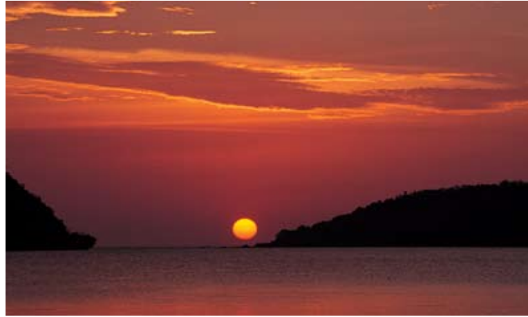
Sunset at Hat Pak Meng

While offering no monumental sights, Trang town is full of character, still very traditional and mostly unchanged in its quiet ways. City sights as such do not extend much beyond a handful of Buddhist and Chinese temples, and instead Trang depends