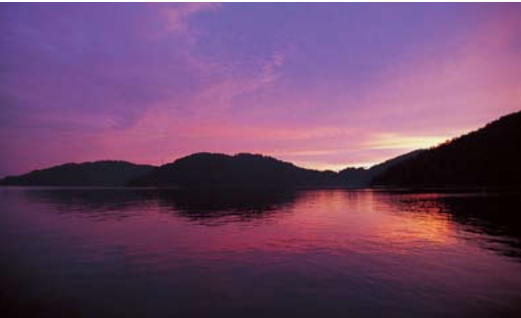
Mu Ko Surin