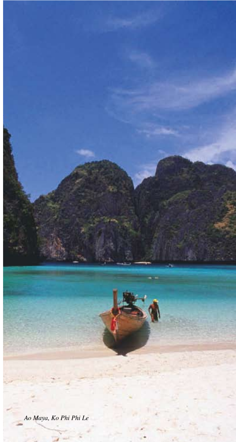
Ao Maya, Ko Phi Phi Le

With a coastline of nearly 200 km. and more than 46 offshore islands, Trang's prime marine attractions are cruising the coastal waters, visiting such notable sights as Tham Morakot or Emerald Cave along with excellent opportunities for snorkelling and scuba-diving. Then, for a change of scenery, inland excursions