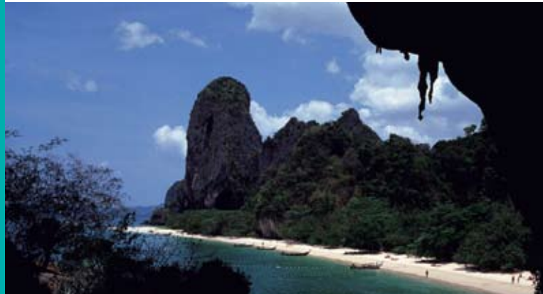
Phra Nang Cave

Now famous as the location for the movie The Beach , there are two principal islands in the Phi Phi group, Phi Phi Don and Phi Phi Le. The former is larger and has been developed with bungalow accommodation and other tourist facilities. Phi Phi Le, smaller and uninhabited, is stunningly beautiful with sheer cliffs, idyllic bays, hidden coves and caves.