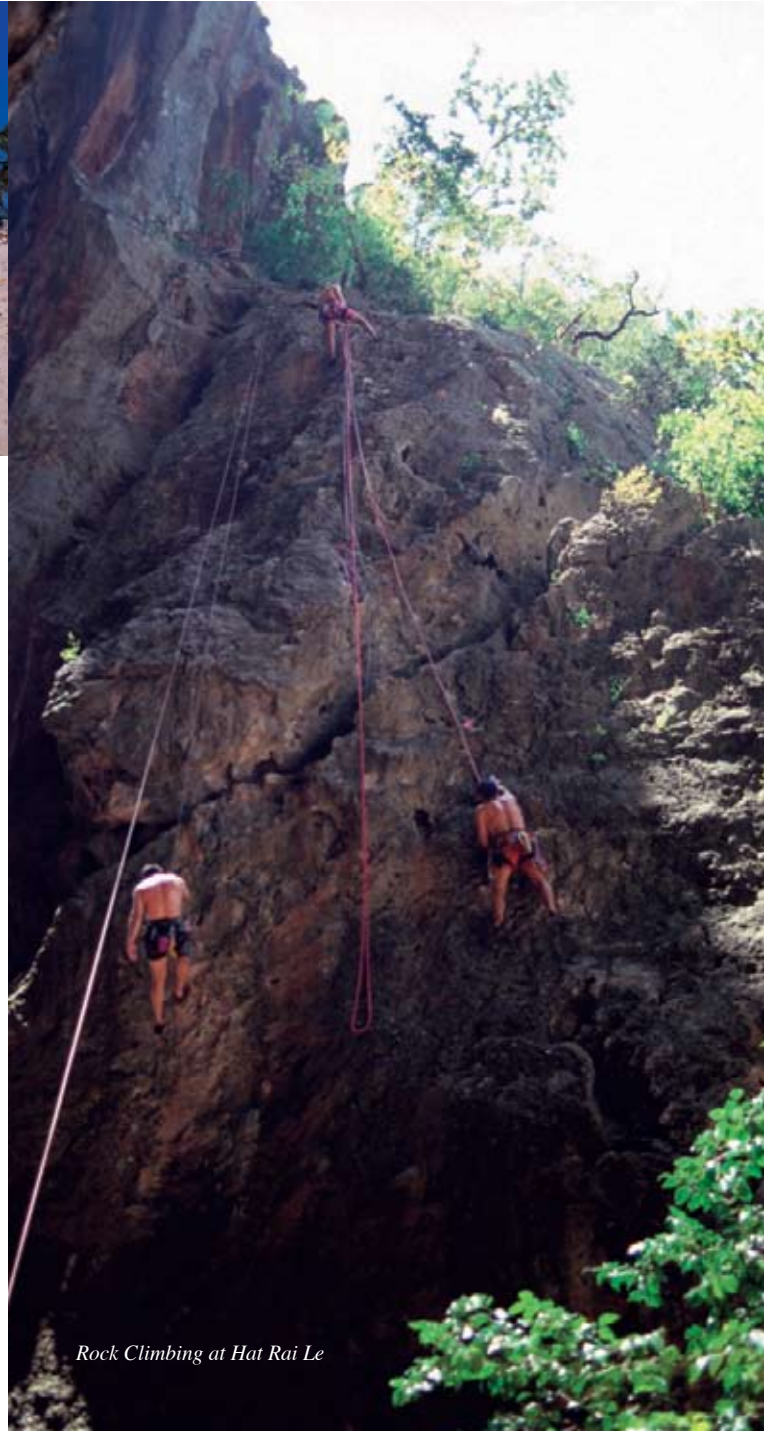
Rock Climbing at Hat Rai Le

The markets and the river frontage of Krabi town, an unpretentious little place huddled near the mouth of the Krabi River, are worth strolling around for their local colour. The main attraction, however, is Khao Khanap Nam, a rock