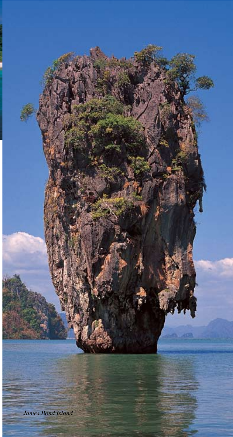
James Bond Island

This National Marine Park, comprising five islands and covering more than 33,000 acres, is located north of the Similans. The islands are best reached from the Khura Buri Pier (125 km. north of Phang-nga town), and takes 4 hours. Again the main attractions are scuba-diving and snorkelling, as the coral formations are spectacular. However, the two largest islands, Ko Surin Nuea and Ko Surin Tai (North and South islands, respectively) have good potential for exploring on land, with several hiking trails and, on Ko Surin Tai, a Sea Gypsy village.