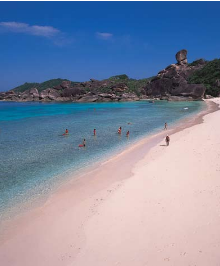
Mu Ko Similan