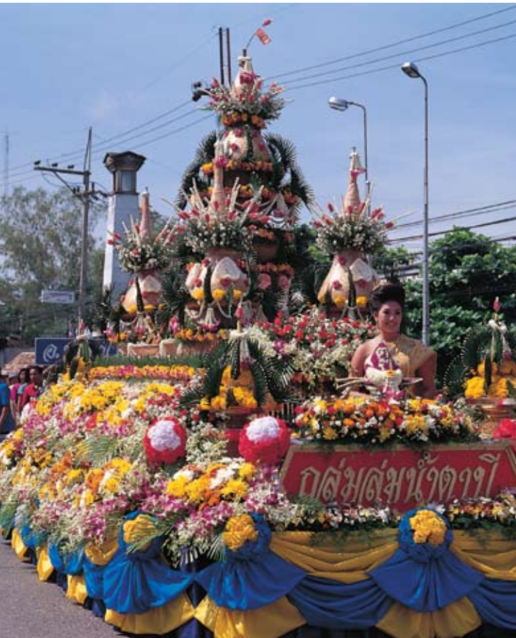
Festival of the 10 th Lunar Month