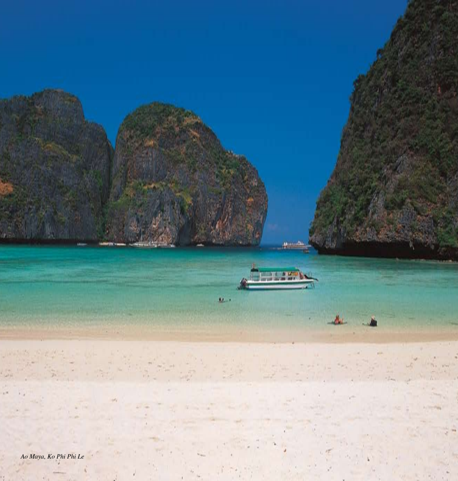
Ao Maya, Ko Phi Phi Le