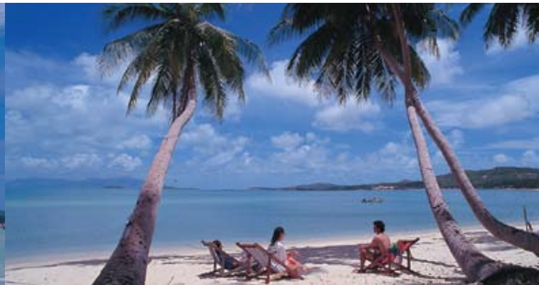
Hat Bang Rak

On the south and west coasts are very isolated beaches not linked by the island's ring road, yet access is easy enough for those in search of tranquility. At Laem Set in the south, the sea is too shallow for swimming. However, the huge smooth boulders on the beach and the coconut palms leaning over at impossible angles make it look spectacular. In the island's southwest, Hat Taling Ngam may not be quite as perfect as Hat Chaweng, but has a long strip of sand that is often deserted and makes an ideal spot for a beach ramble. At the northern end of the bay, the luxurious Ban Taling Ngam Resort has several swimming pools and villas set on a hill with great views of the beach.