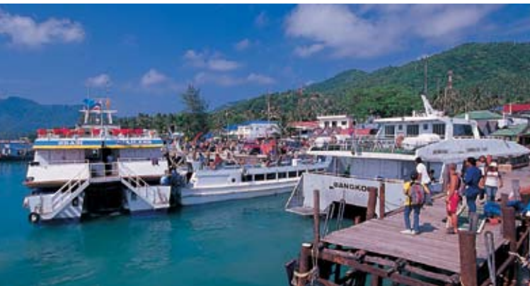
Ko Tao Pier

Trains from Hua Lamphong Railway Station in Bangkok to Surat Thani leave many times a day and take 12 hours. The Surat Thani Railway Station is 12 km. from town and there is a shuttle bus between the station and the town.