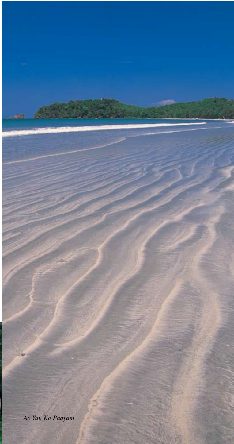
Ao Yai, Ko Phayam