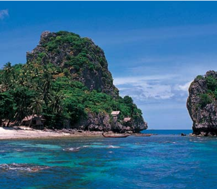
Ko Langa Chio

of Mu Ko Chumphon National Park near Hat Sai Ri, which is 20 km. south of Chumphon. The beach is another long stretch of enticing sand with lodgings.