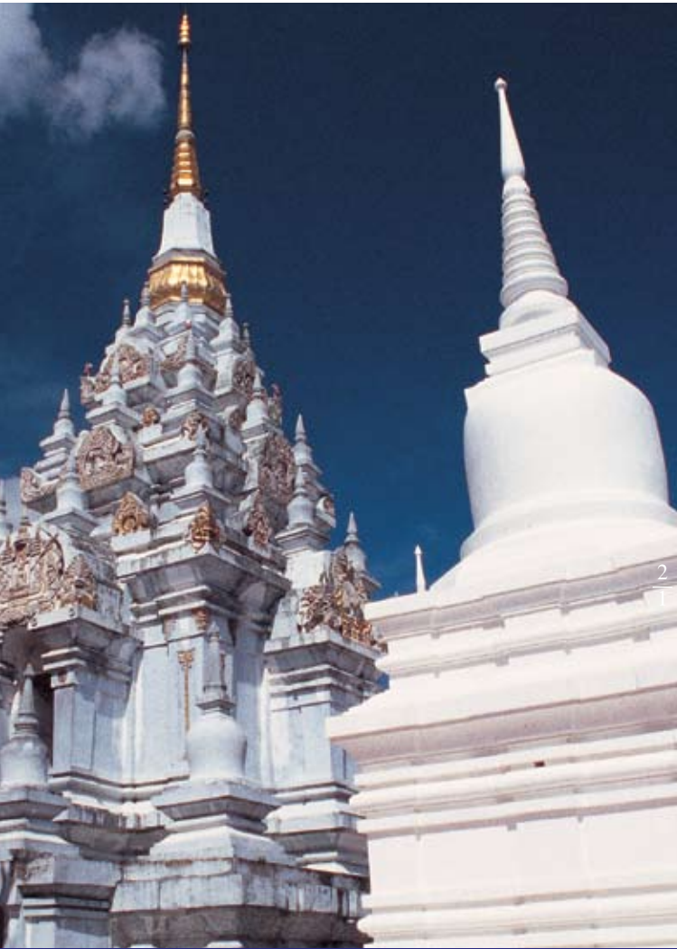
Wat Phra Borommathat Chaiya