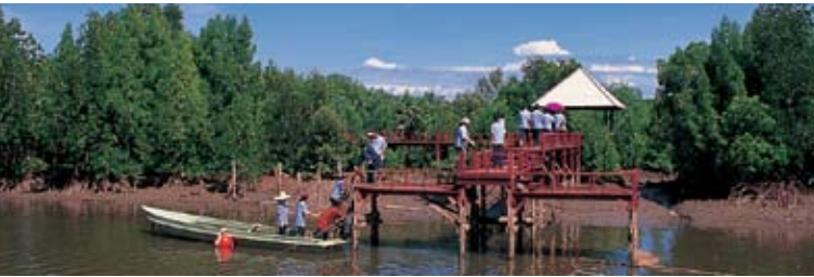
Mu Ko Chumphon National Park