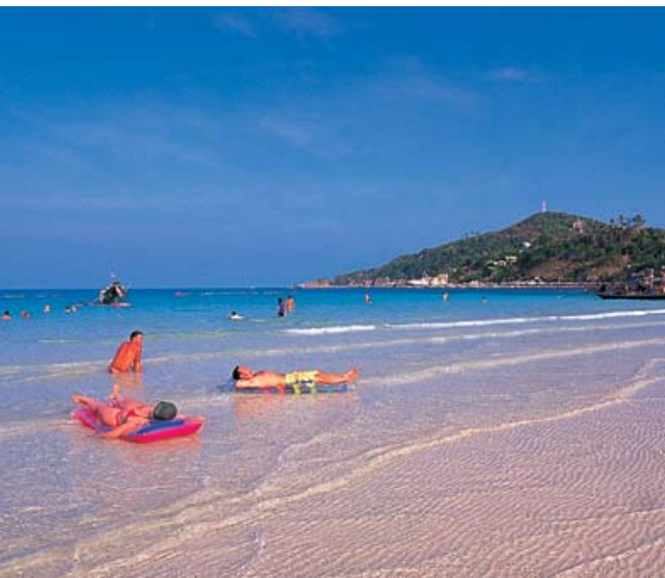
Hat Rin, Ko Pha-ngan