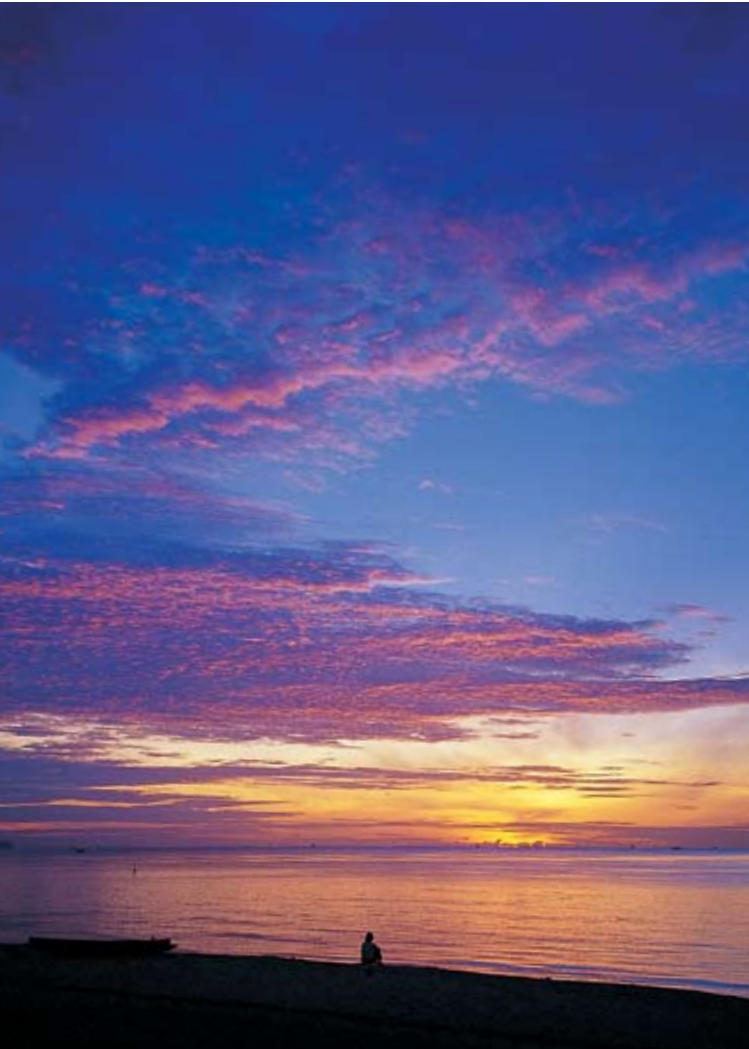
Hat Thung Wua Laen