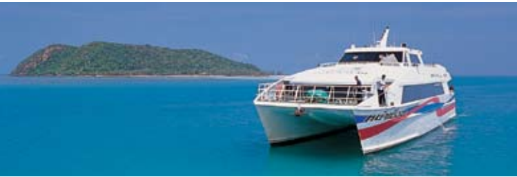
Cruising in the Gulf