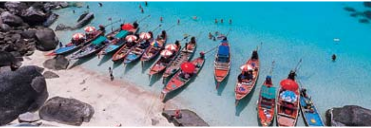
Ao Muang, Ko Tao

ler happy for a week or two, but for anyone spending even a few days here, an opportunity not to be missed is a trip to the emerald islands of the Mu Ko Angthong National Marine Park, which offers another perspective of a tropical paradise.