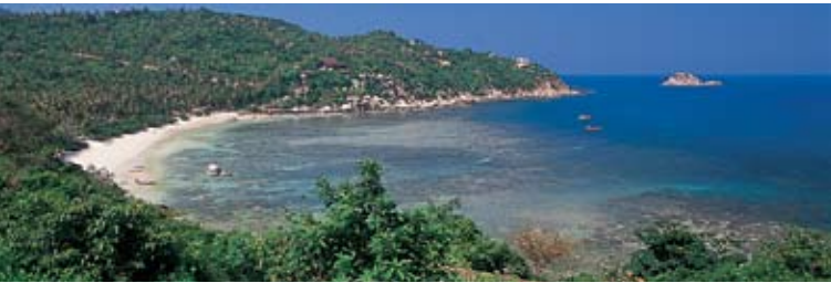
Ao Thien Ok, Ko Tao