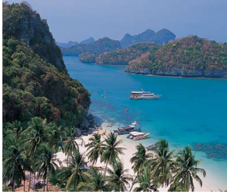
Mu Ko Angthong National Marine Park

aquamarine waters. Most people come here for a day trip tour from Ko Samui, which is easy to organise. There is a fantastic viewpoint on Ko Wua Talap, just above the park headquarters, looking out over the uninhabited, pristine islands. Trips around the park usually include a visit to a delightful concealed lagoon on Ko Mae Ko, as well as the opportunity to paddle a sea kayak around the strange limestone formations. For more information, contact the National Park, Wildlife and Plant Conservation Department Tel. 0 2562 0760 or Mu Ko Angthong National Marine Park Tel. 0 7728 6025, 0 7728 6588, 0 7728 0222. Website: www.dnp.go.th