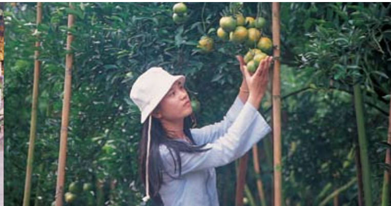
Orchards in Amphoe Lang Suan

Each March or April, the town holds a Marine Festival, which includes cultural and folk art exhibits, a fishing competition, and seafood festival, as well as a mini-marathon and a wind-surfing competition at Hat Sai Ri.