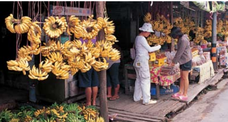
Fruit Market, Amphoe Lang Suan

Centre. The park includes beaches like Thung Makham and Arunothai, as well as over 40 small offshore islands. Several of them, like Ko Chorakhe and Ko Ngam, are surrounded by beautiful coral reefs, while Ko Thong Lang has a long white sandy beach. Tel. 0 7755 8144