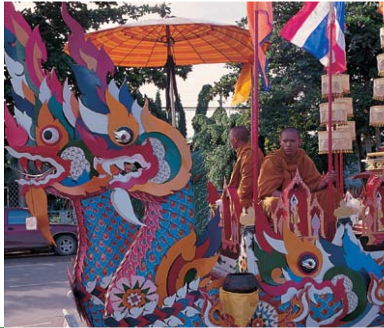
Chak Phra Festival

ary and April, when skies are usually clear. There are plenty of places to stay near the visitor centre.