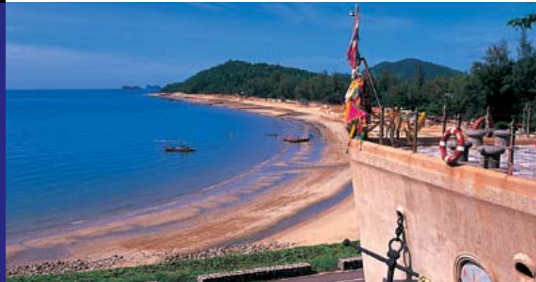
Hat Sai Ri

It is also possible to go diving or snorkelling around the islands