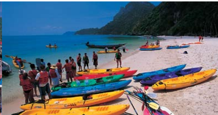
Mu Ko Angthong National Marine Park

Ask for recommendations on where to stay in Surat Thani at