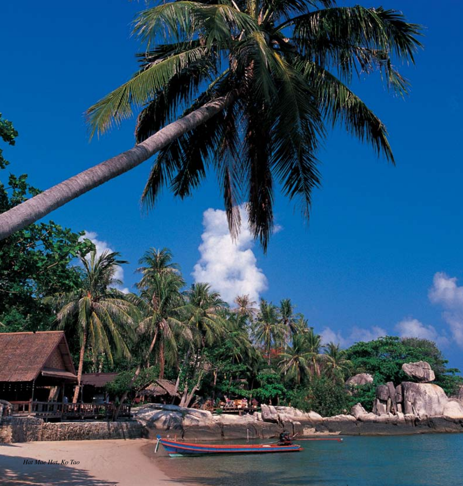
Hat Mae Hat, Ko Tao