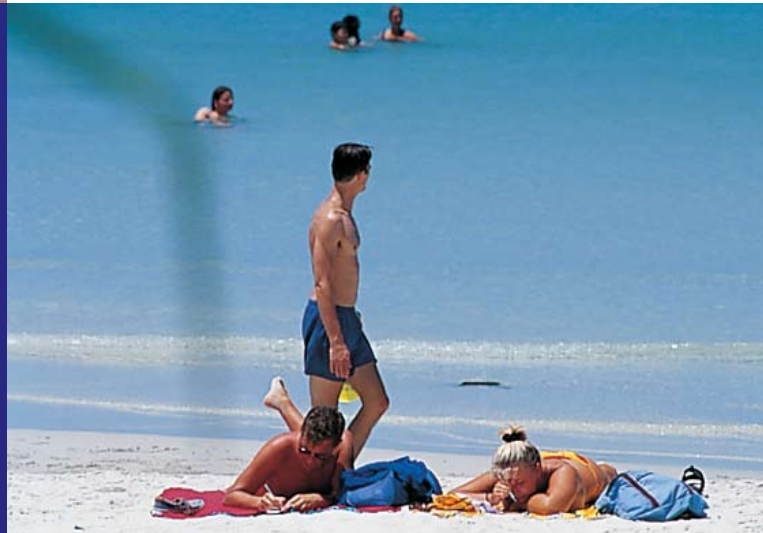
Hat Rin, Ko Pha-ngan

There is plenty on Samui to keep even the most jaded travel-