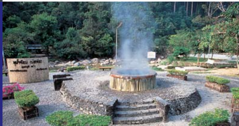
Ranong Hot Springs